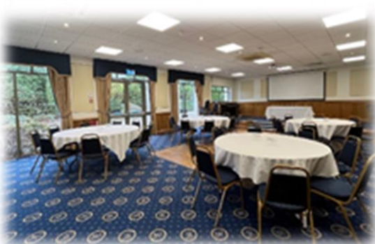
The Maplin Suite set-up for a Wake Reception