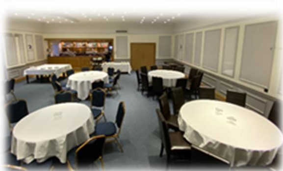
Olympic Suite set-up for a Wake Reception