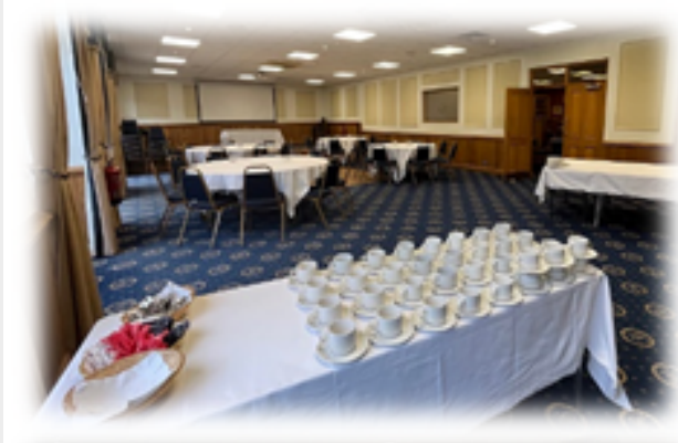
The Maplin Suite set-up for a Wake Reception