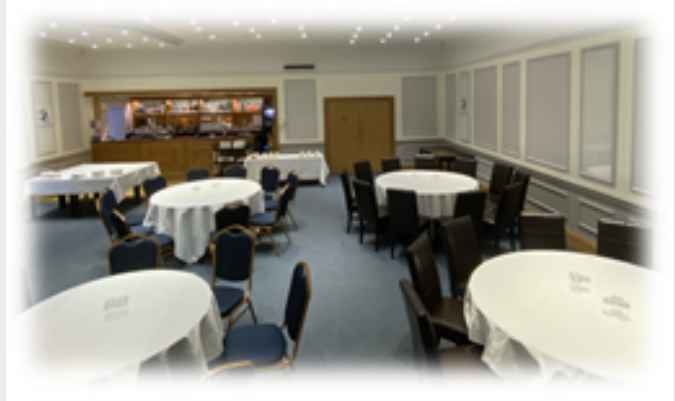
Olympic Suite set-up for a Wake Reception