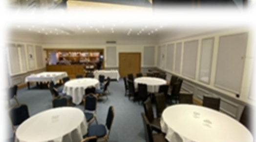
Olympic Suite set-up for a Wake Reception Direct access from main car park and with exclusive bar facilities