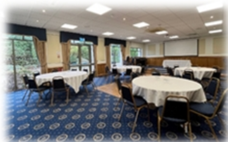
Maplin Suite set-up for a Wake Reception Access via main entrance (front of building). The suite benefits from natural daylight & en-suite facilities. The fully staffed bar is located just outside of the room.